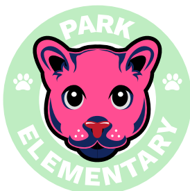
Alteration of logo color outside the palette